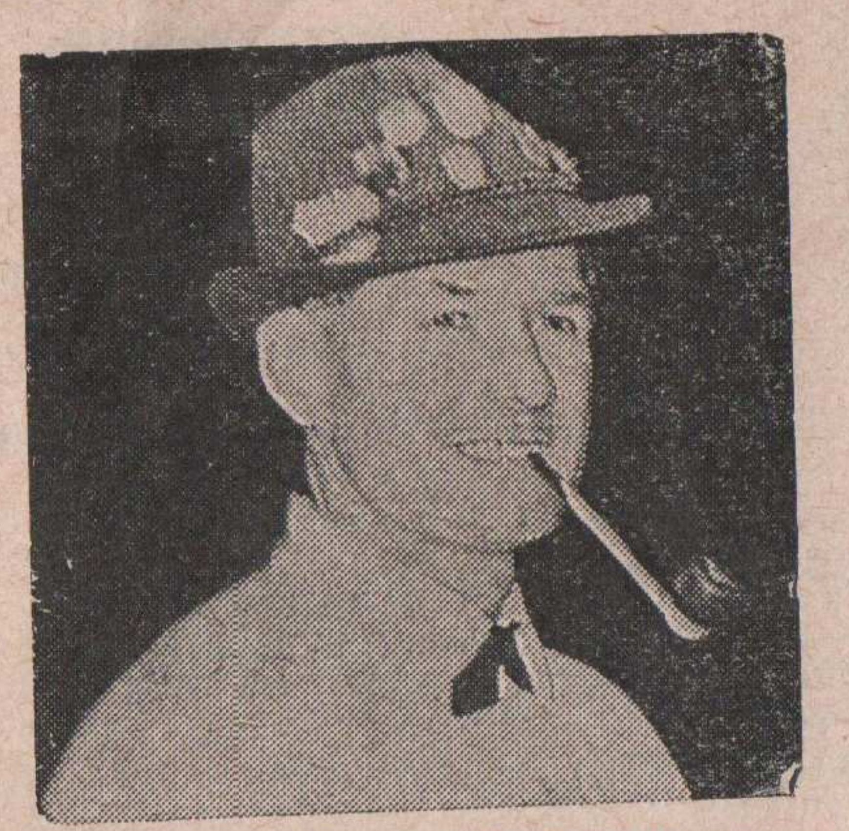
SUMER TROPHY MEETNE