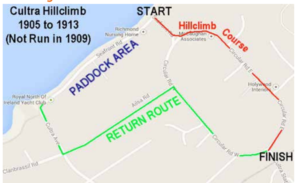
The original course and return ran clockwise and was only slightly longer than today's