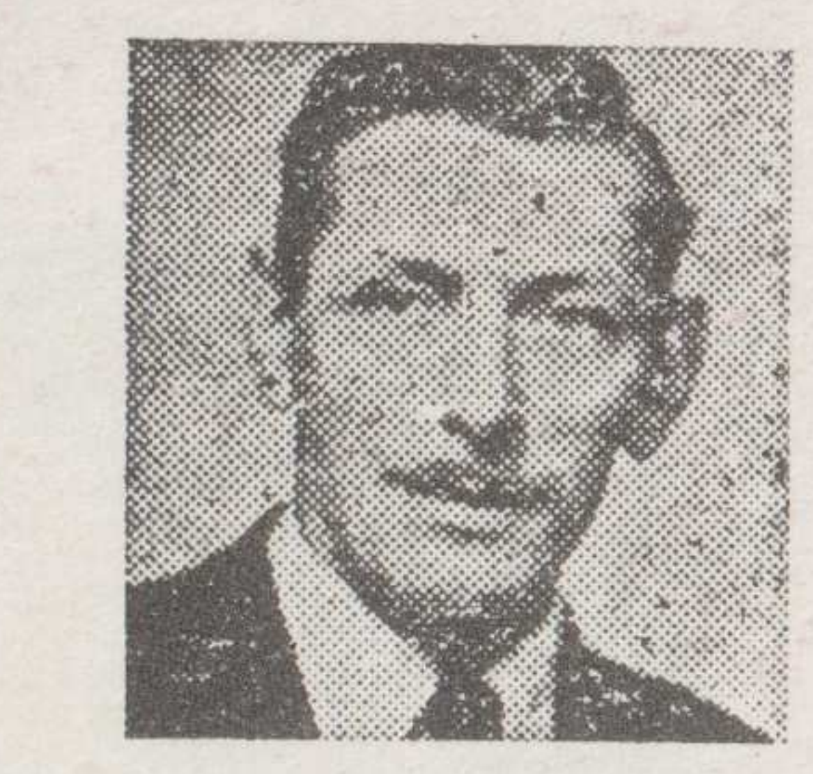
Members of I.P.A International Promoters Association

DENMARK — Denmark Autocar Club, Copenhagen