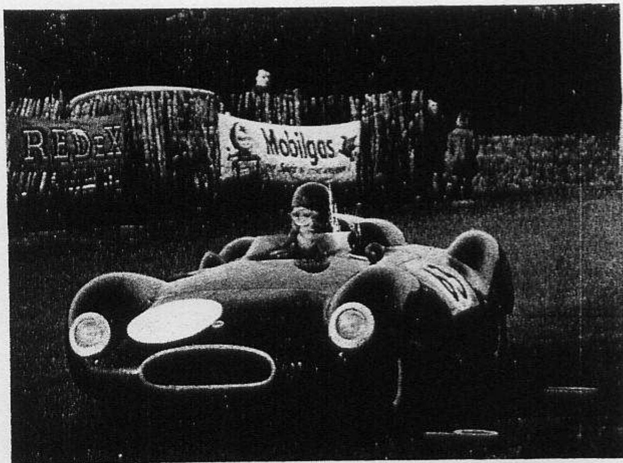
Cooper/Climax Sports/Racing Car seen at last years meeting.